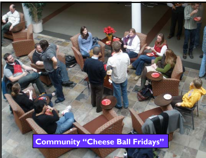
Community "Cheese Ball Fridays"