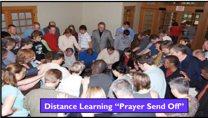
Distance Learning "Prayer Send Off"