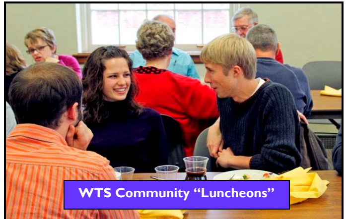
WTS Community "Luncheons"