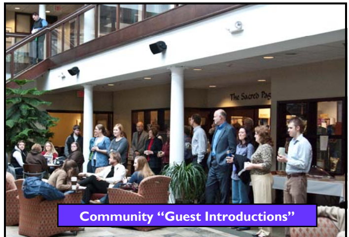
Community "Guest Introductions"